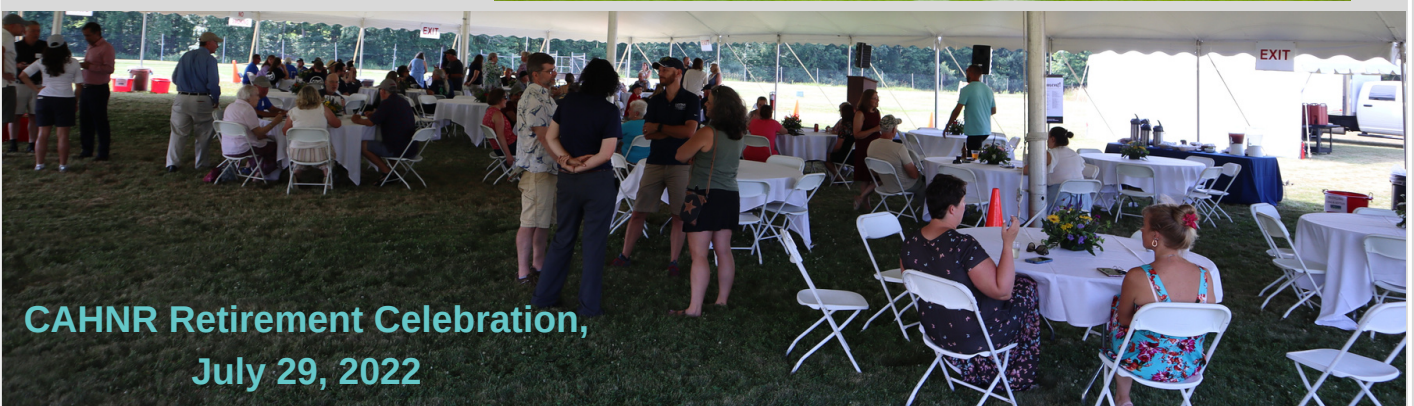
CAHNR Retirement Celebration, July 29, 2022