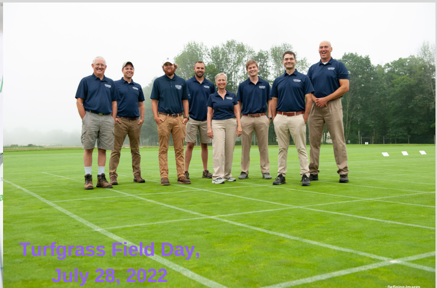
Turfgrass Field Day, July 28, 2022